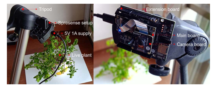
Figure 3: Real-world testing: Inference on Sony Spresense.

Image Processing. The captured plant sample for inference using thus trained models need pre-processing before feature extraction. We initially use Otsu's adaptive thresholding mechanism to segment plants from the background. For small leaves, the Otsu threshold segments the image leaving some noise at the periphery of the