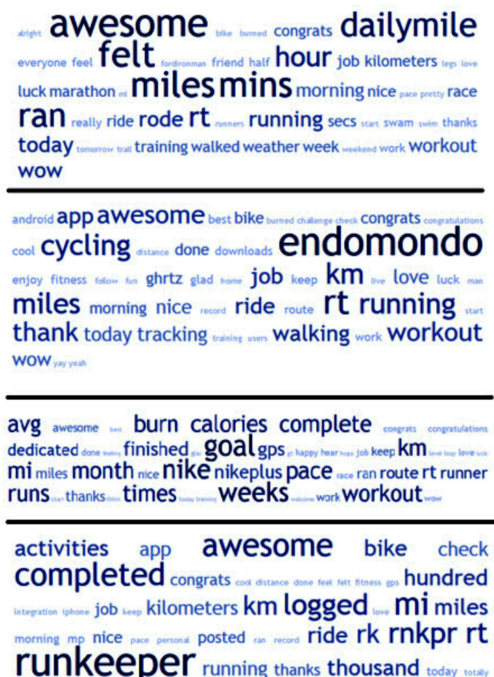
Figure 2. Word clouds by mobile fitness app.