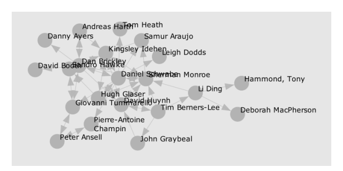
Figure 9: Identifying the network of people in a particular thread

a particular thread (in that case, from the LOD list), where we gave more weight to the edges that appear often (i.e., representing lots of quote/response patterns between the authors). This shows where the argumentation happens, and between which users — the edges having more weight make the nodes be closer in the graph — such patterns could have also been identified by applying an HITS algorithm to the graph [19]. In addition, we could go further and show how such patterns evolve in time, for instance to see in a community which people are involved in the discussion and how discussion moves from one sub-network to another, which might be useful when consensus must be reached in communities.