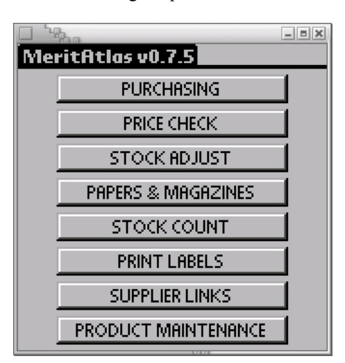
Fig. 2: Initial screen showing menu options.

Some custom implementations of many controls exposed by the SuperWaba consortium were necessary and these were returned to the development community. One was the addition of a native method to SuperWaba that allowed for the decoding of special EAN-13+2 barcodes.